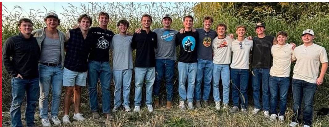
The long-standing Dynamo campout formal took place Saturday, September 27. Huge thanks to our Beta band who did a great job performing for everyone.

LINKEDIN BETA THETA PI, UNIVERSITY OF NEBRASKA-LINCOLN